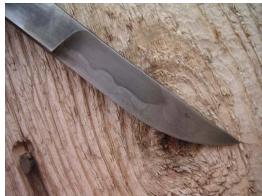
-Temper lines 101